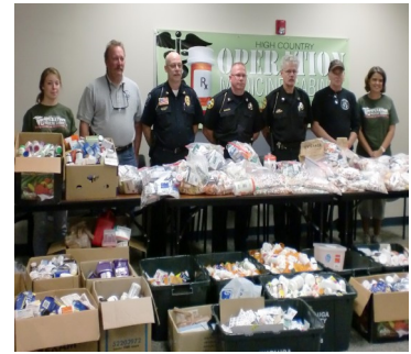
Drug Take-Back Event

To dispose of prescription and over-the-counter drugs, call your city or county government's household trash and recycling service and ask if a drug take-back program is available in your community. Some counties hold household hazardous waste collection days, where prescription and over-the-counter drugs are accepted at a central location for proper disposal.